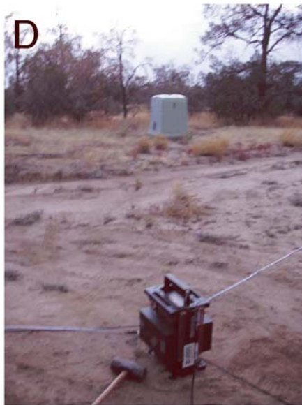
Flat, Riverside County, California. Site location 33.607^{\circ}\text{N} 116.453^{\circ}\text{W} . we collected this data. Photo A is of the source which is located about y extends to the south from the shaker shown in photo B. Photo C h from the source and the reverse oriented to the south.