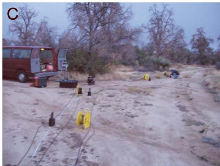
Figure A9.—Site 606APF (CSMIP site 5044), located at Anza - Pinyon. The poor quality of the pictures is due to the low light conditions when 7 meters west of the NGA station shown in photo D. The reverse array shows the full array facing south with the forward array extending north.